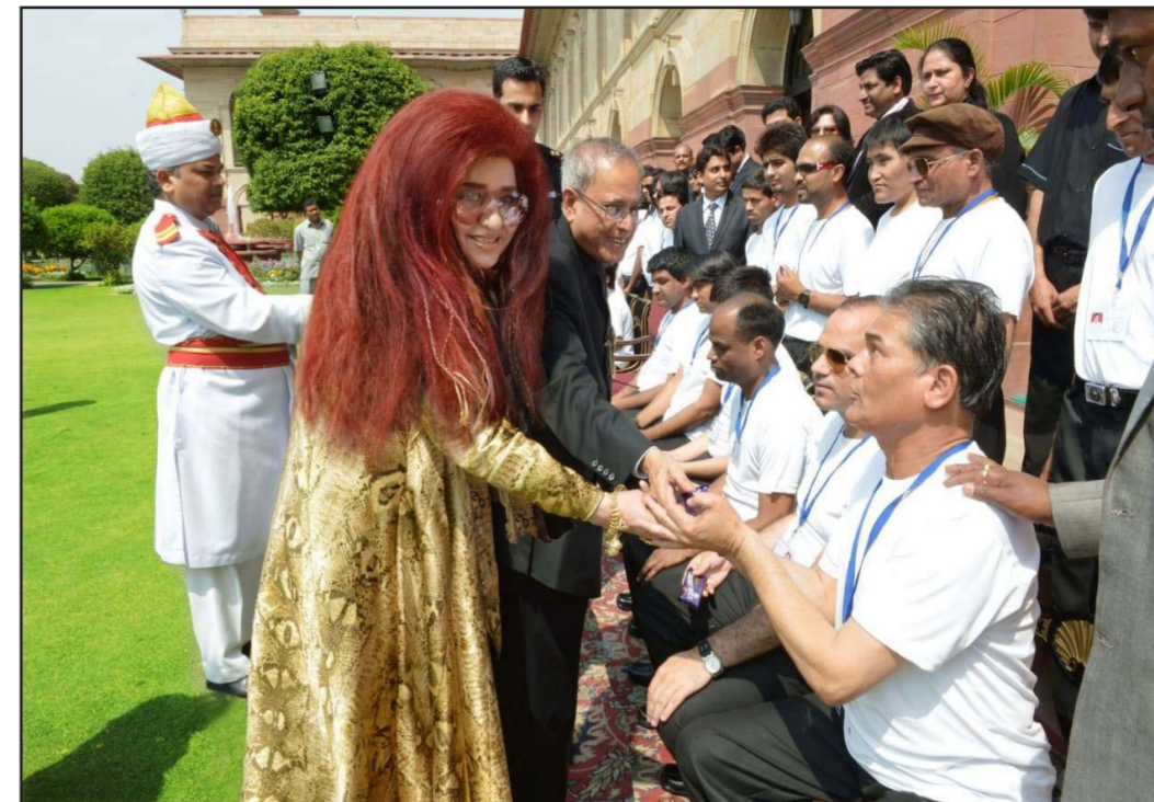
Former President, Shri Pranab Mukherjee and Shahnaz Husain distributing chocolates to the blind students of Shasight at Rashtrapati Bhavan

Bengaluru, Karnataka has indicated its preference for the first option offered by the Centre to offset GST revenue losses under which it is expected to get Rs 18,289 crore including Rs 6965 crore from cess collected. The rest Rs 11,324 crore, it would be able to borrow through a special window from RBI with the full burden of principal and interest being borne of the cess fund to be collected in future. The decision was taken after chief minister BS Yediyurappa met senior officials of the state finance department according to a statement from his office. Officials said that the decision had been taken after weighing all pros and cons in the large interests of the state.